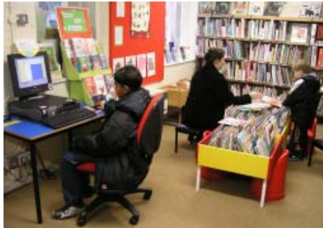
The well-used children’s section, showing the limited space available for story times

“Although the County Council’s conversion of the former fire station represented a significant investment toward providing an improved service in Eynsham, the library has not kept pace with the population growth in the catchment area”, comments Andrew Coggins, County Librarian. “As a result it is currently only 53% of the size required by the county’s standard. In spite of this the Library Service has continued to improve facilities. In 2002/03 People’s Network terminals were installed, on the County Council broadband network, providing free fast access to the Internet. From December 2003 these terminals were able to access the whole county catalogue of nearly 1 million items. In the summer of 2004, Galaxy, a computerized library management system, will network Eynsham with the other 50 libraries in Oxfordshire. I welcome the Friends initiative to improve the library still further, and the County Council hopes to be able to