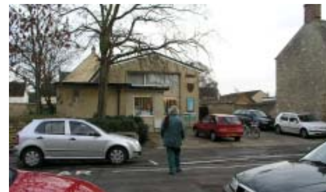
The library, once the old fire station, in Mill Street, Eynsham

are working with Oxfordshire County Council to raise funds for a three-phase, badly needed extension, also supported by the MP for West Oxfordshire, the local County Councillor, West Oxfordshire district councillors and Eynsham Parish Council